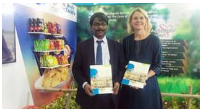
SOCIO-ECONOMIC IMPACT ASSESSMENT OF PEPSICO'S INITIATIVES