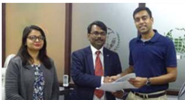
IACG SIGNS MOU WITH ASSIST HEADQUARTERED AT PHILIPPINES