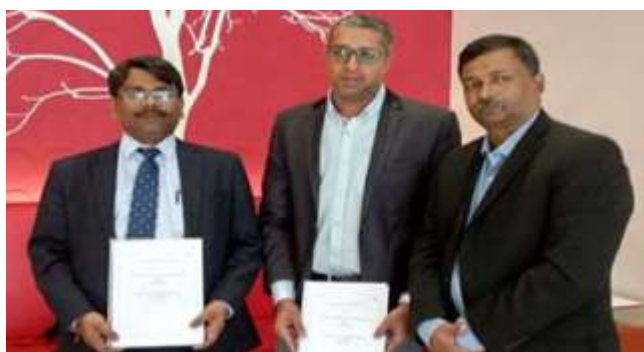
IACG SIGNED OFF AN AGREEMENT WITH FARM LOGICS TO WORK TOGETHER BOTH IN ASIA