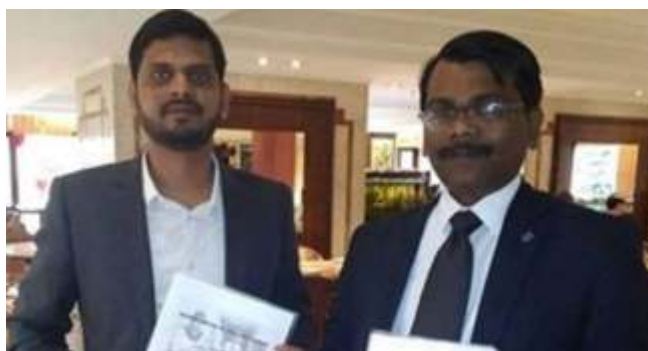
CROPIN TECHNOLOGY & IACG SIGN MOU TO SUPPORT SUSTAINABLE AGRICULTURE